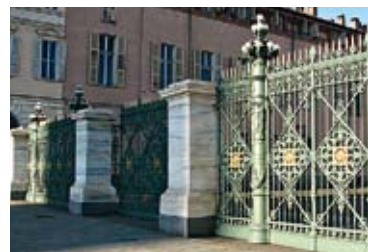
Palazzo Reale in Turin, protection of the fencing (stone parts) and the base with ISOGRAFF.