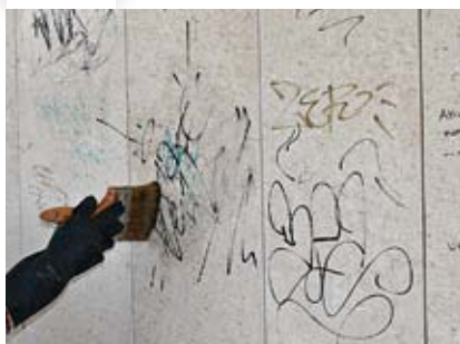
Application of GRAFFITI REMOVER detergent