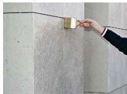
Re-application of ISOGRAFF, sacrificial anti-graffiti protective coating