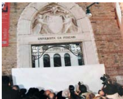
Cà Foscari gateway in Venice, protection of the stone parts with ISOGRAFF.