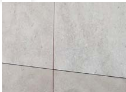
Surface cleaned of graffiti