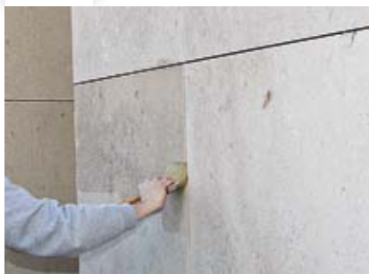
Application of ISOGRAFF, sacrificial anti-graffiti protective coating