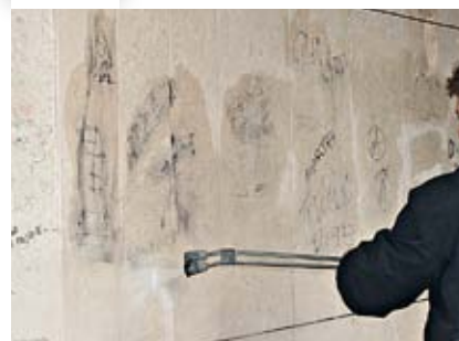
Removal of the defacing using a wire brush and/or pressurized hot water