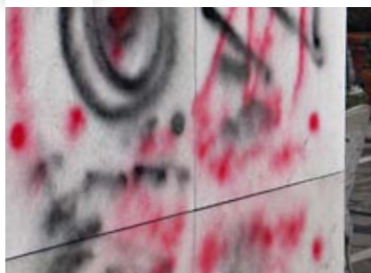
Defacing of the wall