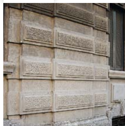
Historic centre of MILAN, removal of graffiti with GRAFFITI REMOVER.