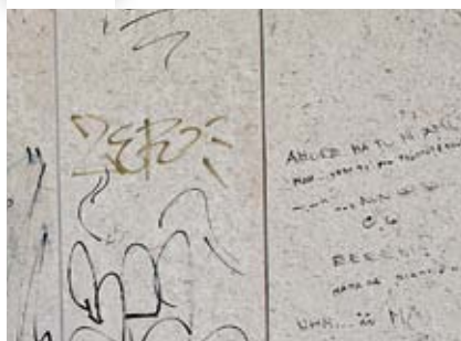
Wall defaced by graffiti or markers